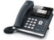
Yealink T4 series